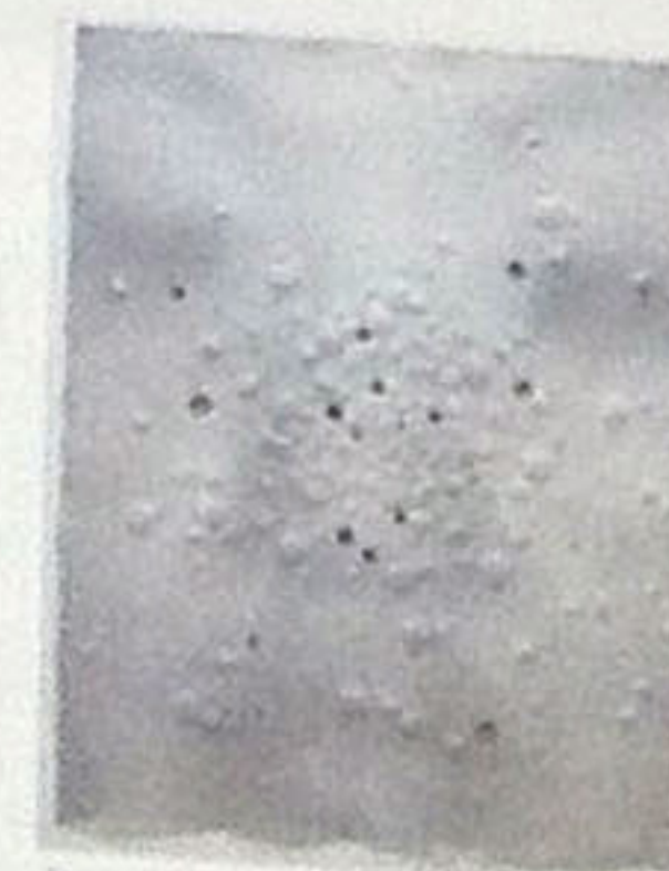
Installation by Lin Tian Miao

Recognised for her installations of domestic tools covered in thread, Lin Tian Miao uses embossing to create the appearance of thread meandering across a human face. Lin is one of China's most widely exhibited installation artists. Her trademark is twine or cotton thread which she uses to wrap objects or integrate them into two-dimensional works. Until April 21. Free admission.