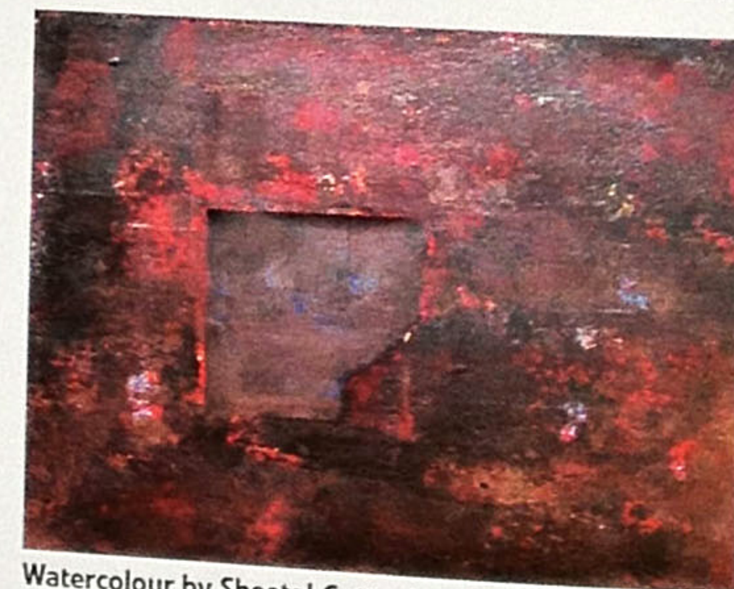
Watercolour by Sheetal Gattani