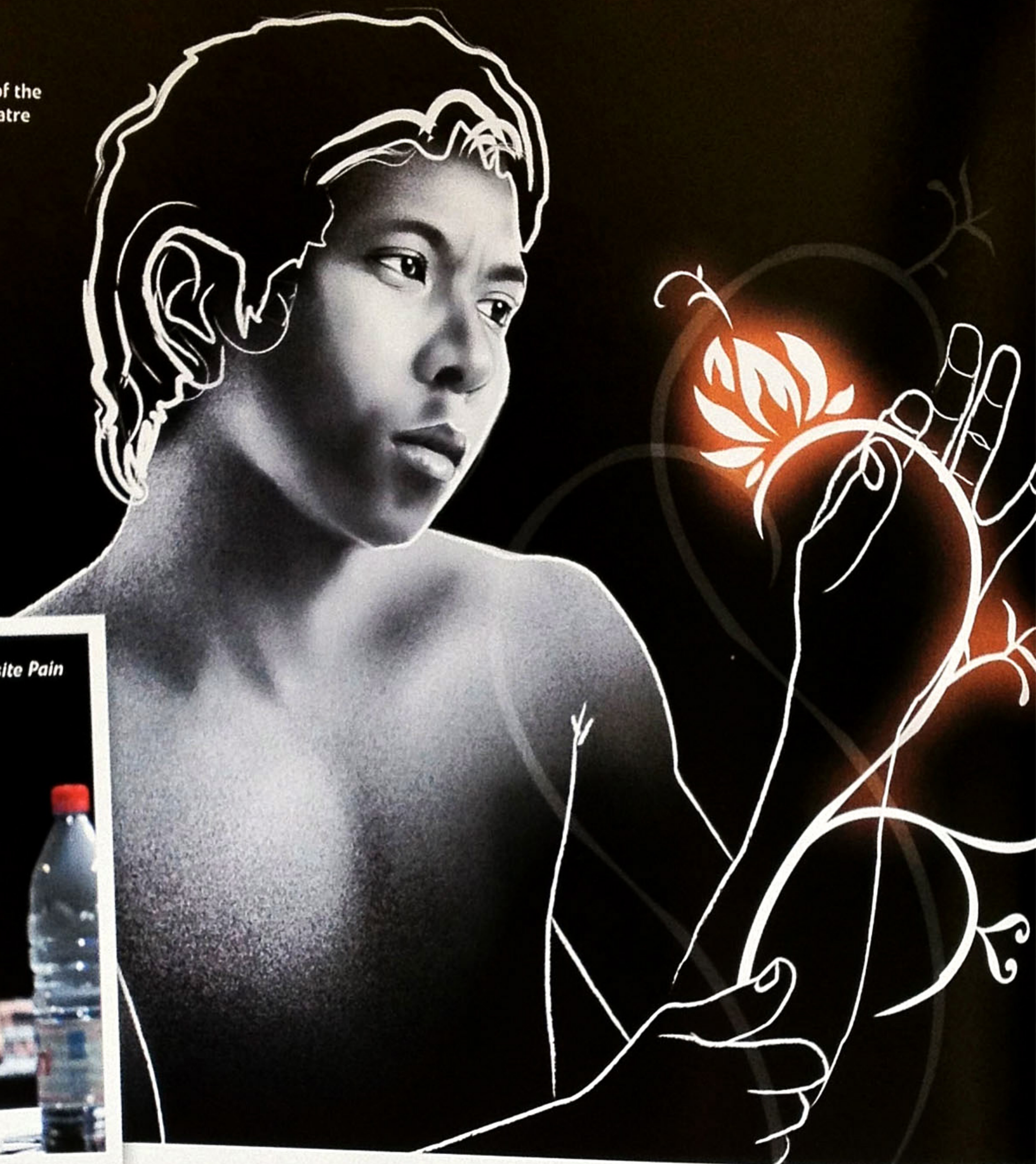
Nothing – part of the Esplanade's Theatre Studio season